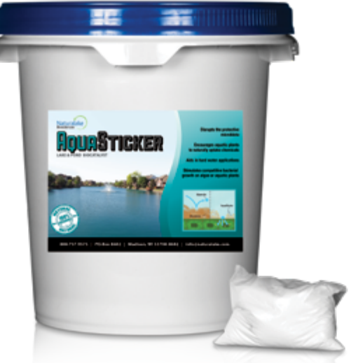
AquaSticker is available in 30 pound containers